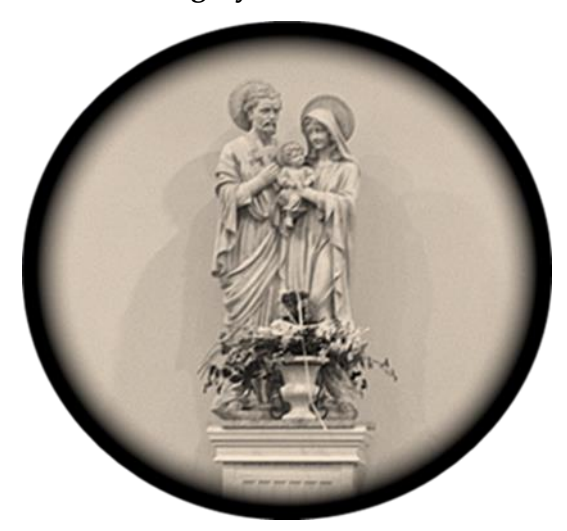
Twentieth Sunday After Pentecost October 6, 2024