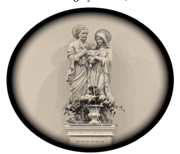
Feast of the Holy Family January 9, 2022