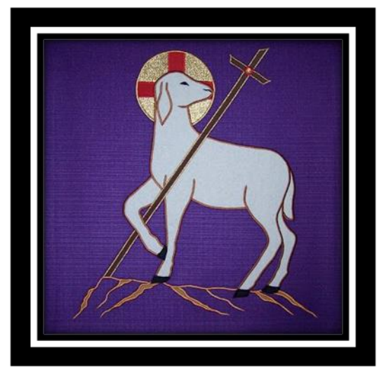
Fourth Sunday After Easter May 15, 2022