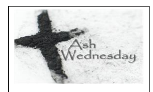
Wednesday, March 2, 2022