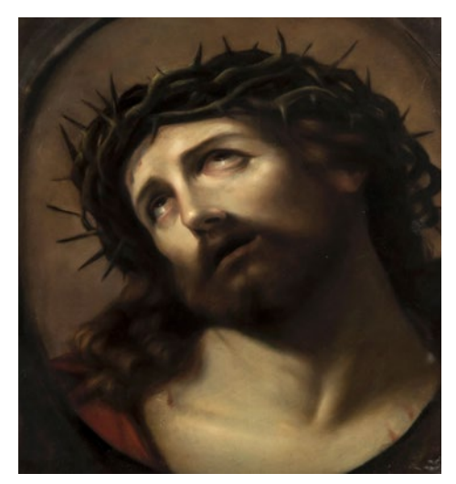
Laetare Sunday March 14, 2021