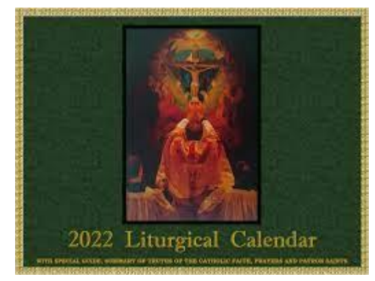
The 2022 Religious Calendars are available for purchase at the rear of the church. The cost is $7.00.

Palm Bay, Florida ~ 321-458-4948 georgehold64@yahoo.com 20+ Years of Experience