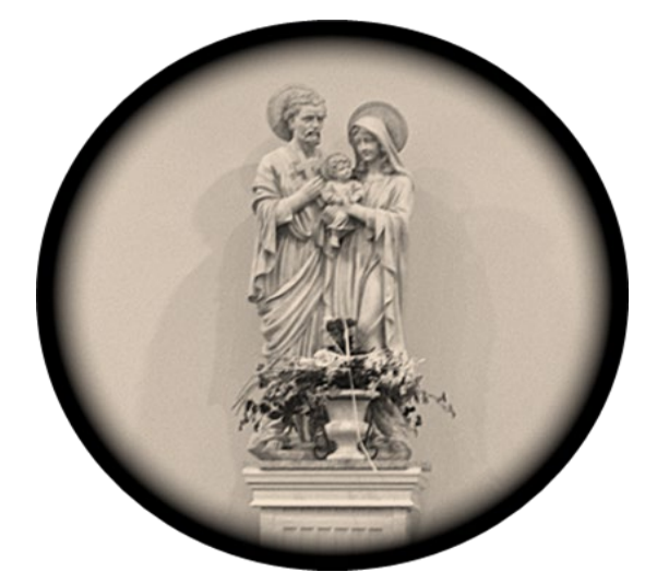
Feast of the Holy Family January 10, 2021